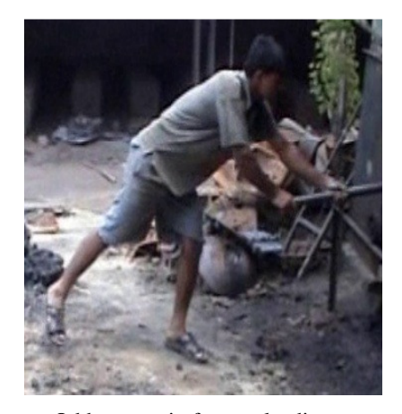
Odd posture in furnace loading