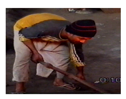
Odd posture in Pouring