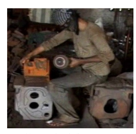
Odd posture in grinding